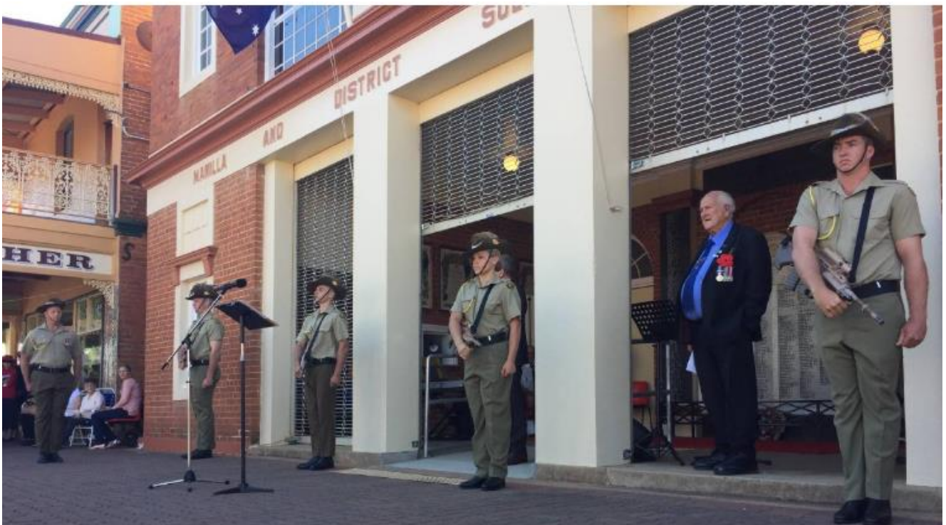
Manilla and Districts Soldiers Memorial Hall Plaque