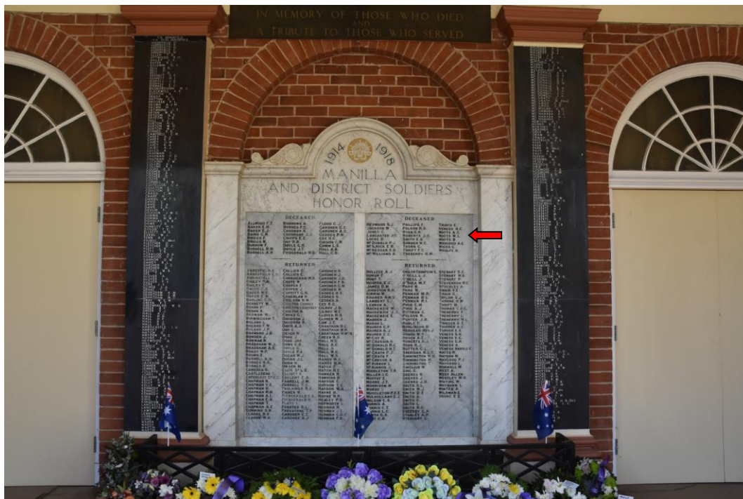
Manilla and Districts Soldiers Memorial Hall Plaque